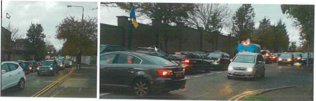
Traffic jams outside St Mary's secondary school – 7 Nov 22 at 4:00pm

The Old Finglas Road is already a major bottle neck at school opening and closing times. This is due to the presence of the two schools St Marys secondary school and St Bridget's National school. At school opening and closing times the traffic along the old Finglas road comes to a complete standstill. Diverting even more traffic away from St Mobhi road along Glasnevin Hill and on to the old Finglas road would have an even more detrimental affect on traffic. As well as causing major congestion on traffic entering and leaving the city it will make it will generate even longer delays for traffic exiting the many side roads on to this artery.